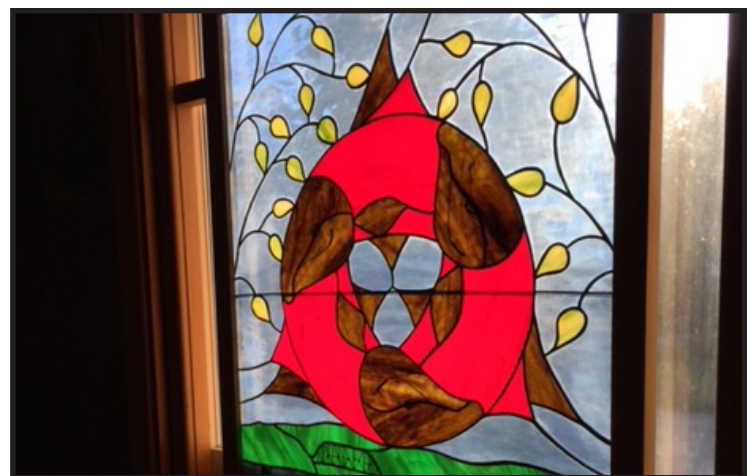
Though St. Patrick may have used the shamrock to explain the Trinity, for Catholics at St. Theresa’s parish in Nenana, this stained-glass intertwined salmon is more apt.