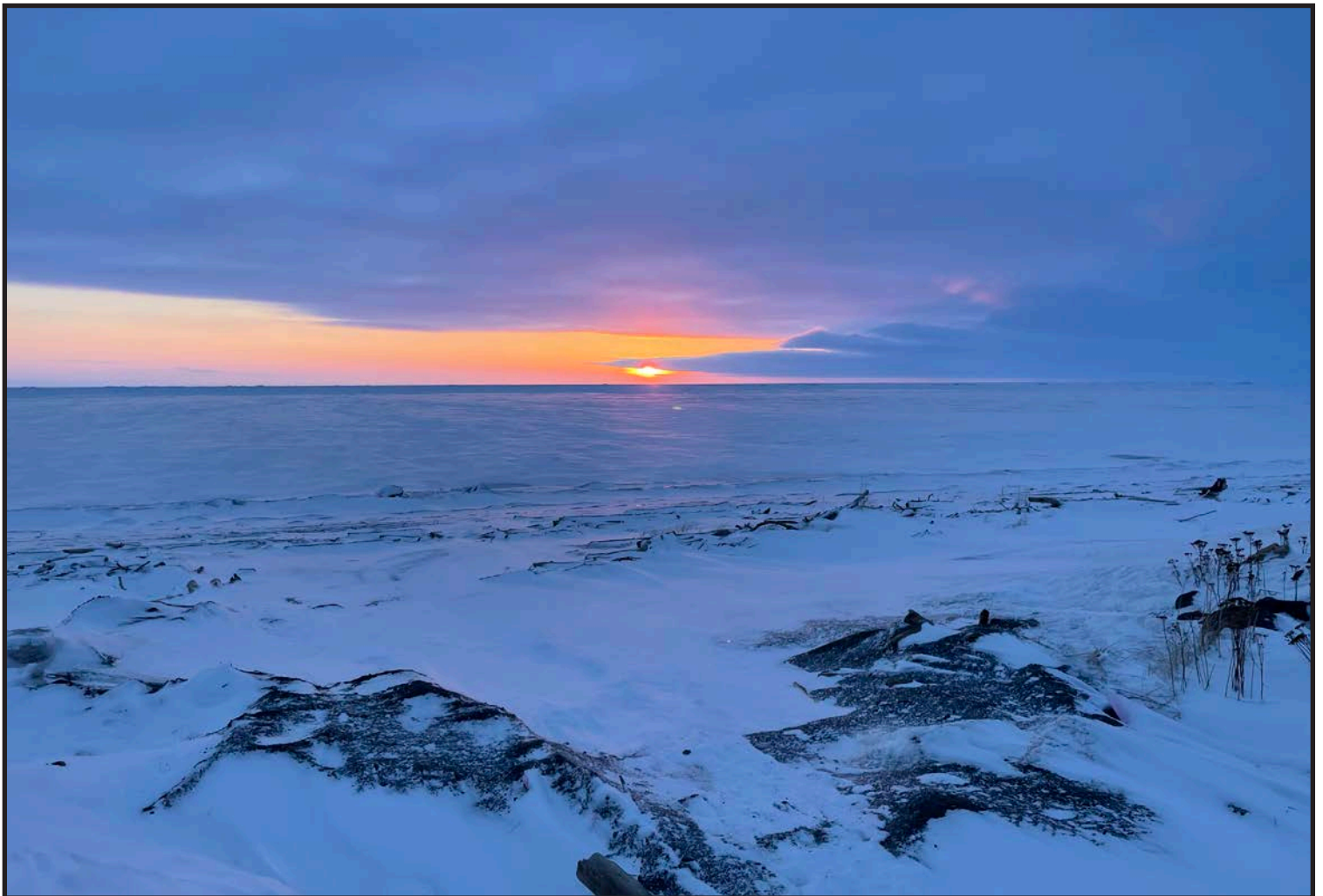
Sunset over Unalakleet

But with a private plane, we had been able to scoot into St. Marys just ahead of the storm, and I was able to bring the Mass and sacraments to the faithful in several surrounding villages for the first time in more than a year. Praise be to God for this pilot’s generous gift of time, talent, and airplane!