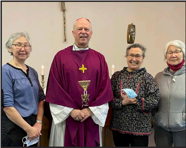
The smiling faces of Holy Angels' parishioners.

those working to attend an evening service. I spent the afternoon walking around the village since it had warmed up to 20 degrees and the winds had subsided somewhat. Everywhere, people waved and said hello to me, despite us being strangers.