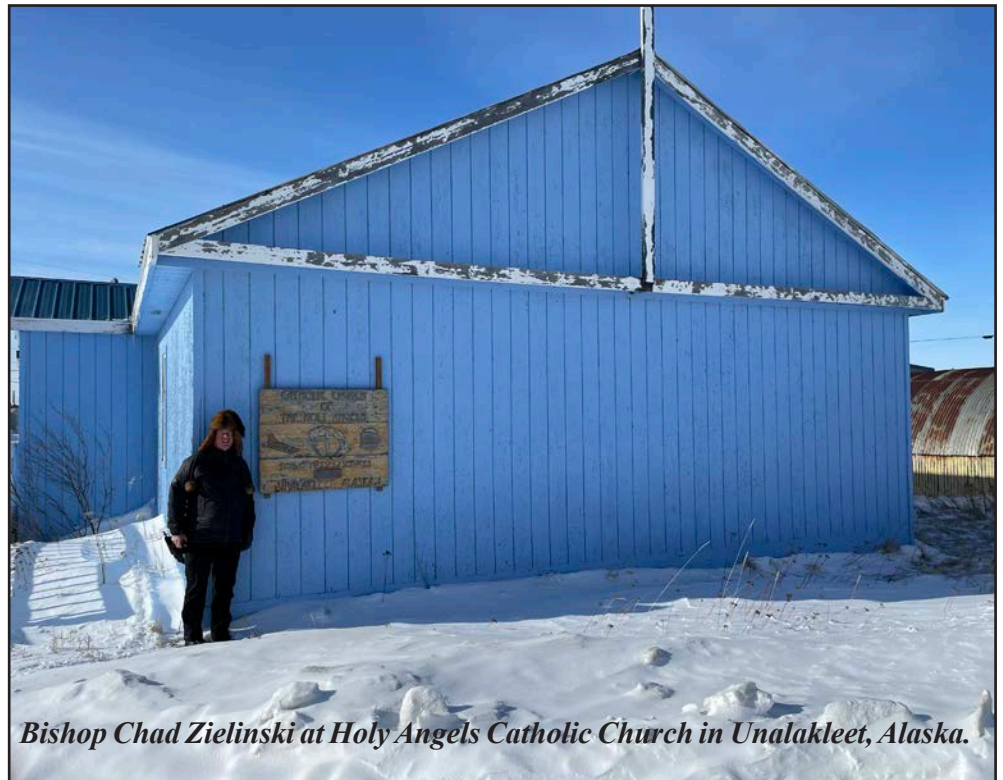
Bishop Chad Zielinski at Holy Angels Catholic Church in Unalakleet, Alaska.

It's interesting to show people outside of Alaska aerial views of our villages. Most villages are so isolated there are no roads in or out of the community, so the fastest way to hop between villages is by