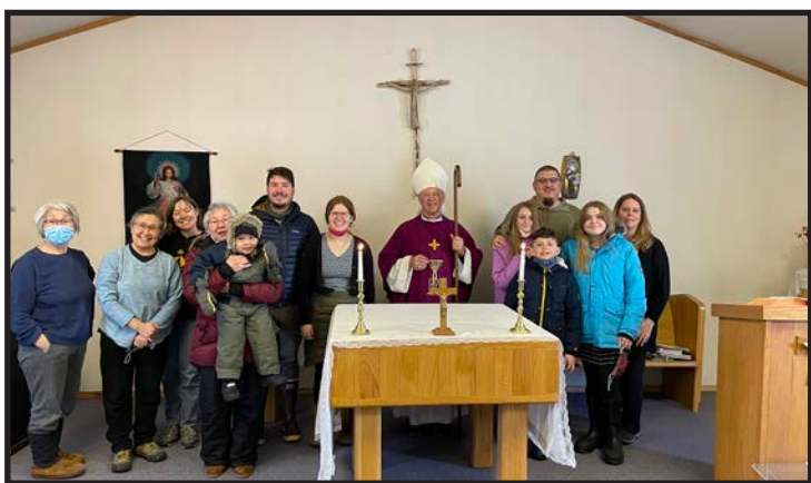
As Sacraments are finally received, there is much cause for joy in Unalakleet!

This morning was rather quiet, which provided time for prayer and putting the final touches on my homily. Near lunchtime, I headed to the home of a local married couple, both teachers, who had invited me over for some homemade salmon chowder. The rich, savory soup hit the spot and warmed my body for the chilly walk back to the church.