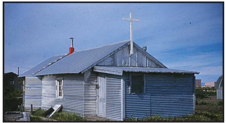
Holy Angels Church as it stood in 1961 before the new church (below) was built in 1993-94.

I returned to the church to discover that the apartment's heater was now flashing a warning light and had stopped functioning. Thanks be to God that the church heater was working, but I knew we had just a few hours until the 7 pm Mass, so I called one of the parishioners. She quickly contacted a villager who was knowledgeable about this particular heater, and he quickly came over. After examining the heater, he said it was a miracle it had quit, because it likely would have started a fire if it had kept running. We made arrangements to get the needed parts for the repair from a store in Nome, but flights into Unalakleet wouldn't get the parts to the church until after I departed on Tuesday. Fortunately,