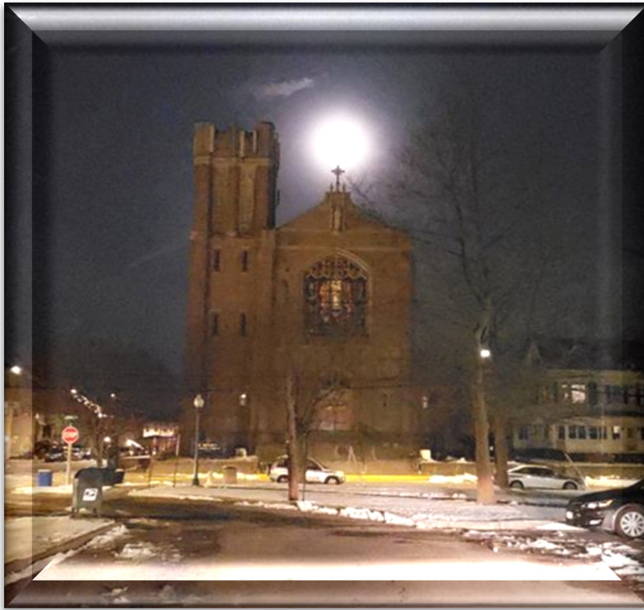
Upon a cold winter's night